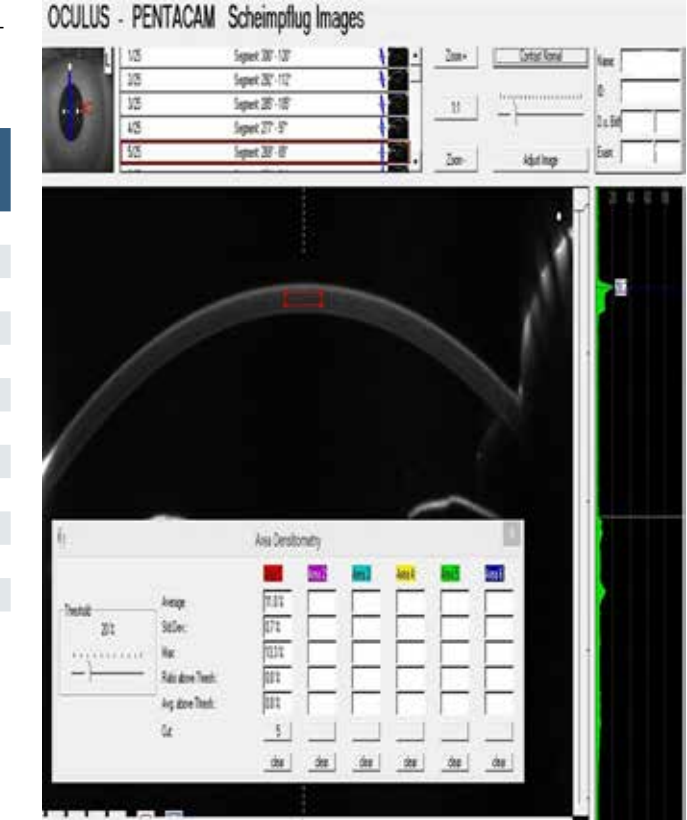
Figure 1. The corneal density measurement with Pentacam® HR Scheimpflug rotating camera system

Independent samples t test; a=0.05 Data are expressed as a mean value ± SD (standard deviation) (min-max); p<0.05 is statisti-cally significant; Group KG: patients with keratoconus, Group CG: healthy control group. K1: horizontal keratometry value, K2: vertical keratometry value, K-mean: mean keratometry value, K-max: maximum keratometry value, CC: central corneal thickness, TCT: thinnest corneal thickness, C-vol: corneal volume, ACE; anterior corneal elevation, PCE: posterior correal devicin, CDAN-mean: mean correal densitometry value, CDAN-max: maximum correal densitometry value, LD-mean: mean lens densitometry value, LDA-max: maximum lens densitometry value